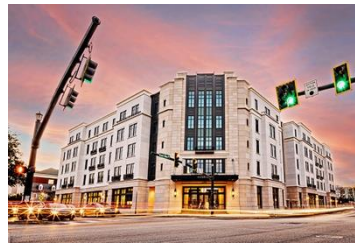
Liberty Place Charleston by Hilton Club Charleston, South Carolina