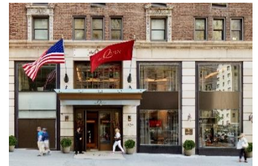
The Quin by Hilton Club New York, New York