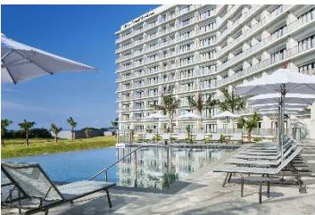
The Beach Resort Sesoko by Hilton Club Okinawa, Japan