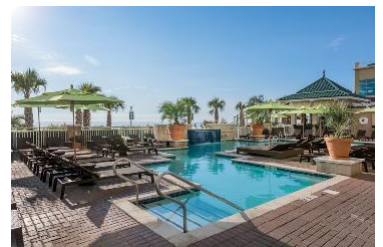
Ocean Beach Club, a Hilton Vacation Club Virginia Beach, Virginia