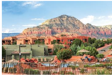
Sedona Summit, a Hilton Vacation Club Sedona, Arizona