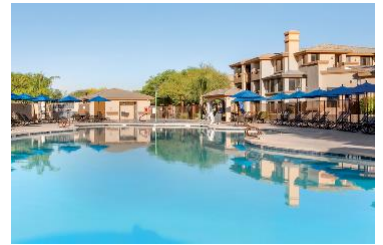
Scottsdale Links Resort, a Hilton Vacation Club Scottsdale, Arizona