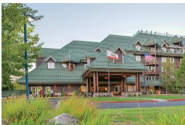
Hilton Vacation Club Lake Tahoe Resort South Lake Tahoe, California