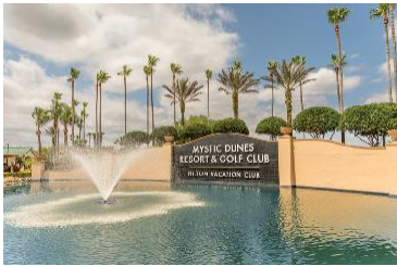
Mystic Dunes, a Hilton Vacation Club Orlando, Florida