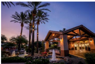
Scottsdale Villa Mirage, a Hilton Vacation Club Scottsdale, Arizona