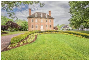
The Historic Powhatan, a Hilton Vacation Club Williamsburg, Virginia