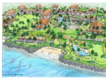
Maui Bay Villas by Hilton Grand Vacations Kihei, Hawaii