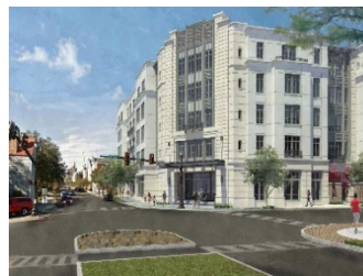
Liberty Place Charleston by Hilton Club Charleston, South Carolina