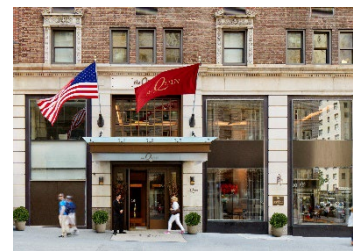
The Quin Central Park by Hilton Club New York City, New York